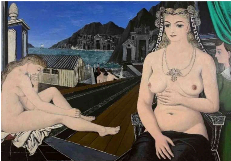
Paul Delvaux (1897-1994), Pénélope , 1946