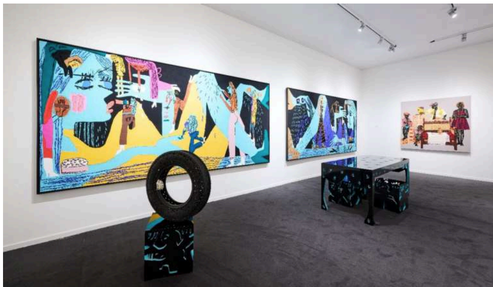
BRAFA 2022 – stand 77 Zidoun-Bossuyt Gallery