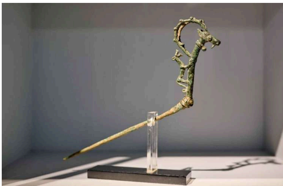
BRAFA 2022 – stand 39 Galerie Kevorkian

Archaeology – For its first participation at BRAFA, the Galerie Kervorkian (stand 16) will present, amongst others, a set of bronzes from Luristan (Iran). Most of them come from a single French collection, including a large and elegant ibex and feline pin from the beginning of the millennium BC.