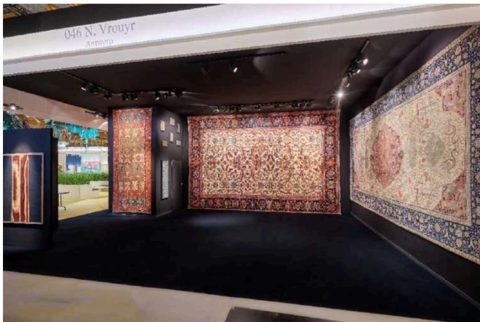
BRAFA 2022 – stand 46 N. Vrouyr

Ancient and modern tapestries – De Wit Fine Tapestries (stand 4) will be presenting a remarkably well-conserved Brussels tapestry of wool and silk dating from 1530 with exceptional colours, illustrating the episode when King Solomon invited his mother Bathsheba to share the throne. On the stand of N. Vrouyr (stand 46), next to an elegant carpet by Petag Tabriz (Iran), discover textiles with shimmering colours by Chinese minorities, including the ceremonial cover of the Dai, Yunnan province. The weavings, with their geometric lines and creative drawings, had an important influence on contemporary art. Finally, the Galerie Latham (stand 96), will be presenting an embroidered work by Annabelle d'Huart (France, 1952), Black Sea Princess, 2013.